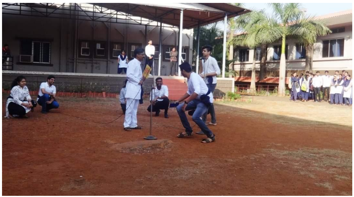
Street Play Performance by students