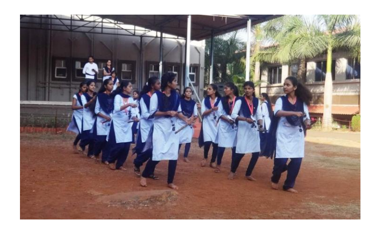
Lezhim by students