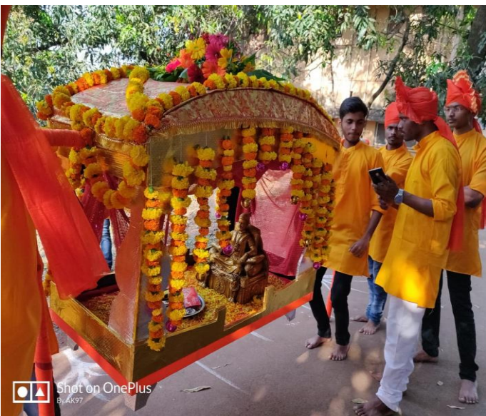
Chhatrapati Shivaji Maharaj Idol Miravnuk